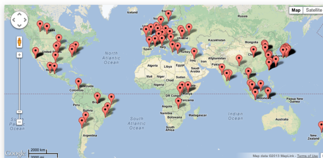
Fig. 2. The geolocation of announced prefixes blacklisted by Google over IPv6. The map was drawn using the maps.js library.